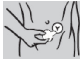
• Direction for use of dilator DILASTOM

Many cases colostomy is trouble-free for the patient. However, complications can occur. Between 8 and 10% of cases (collated global data) result in stenosis or stricture of the stoma lumen. To accurately define whether or not stenosis has occurred, consideration must be given to the diameter of the stoma, and the elasticity of the intestinal wall and of the surrounding tissue. Colostomy stenosis are described as either precocious or belated (early or late) depending on the post-operative time interval before the stenosis becomes evident. A further categorisation into either cutaneous or fascial has been identified, dependant on the tissue area affected: the muco-cutaneous junction or apical respectively. When stricture occurs, difficulties can be experienced both in the discharge of faeces and in execution of irrigation procedures. The instigation of dilator therapy can stop the progressive stricture of the external colostomy orifice and, if correctly applied, reverse the process.