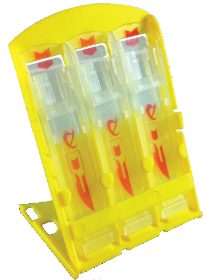
Nodules help stabilise cassette by gripping drape.

BladeCASSETTE has been specifically designed to enable easy and accurate counting of blades after use in theatre.