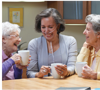
In The Home