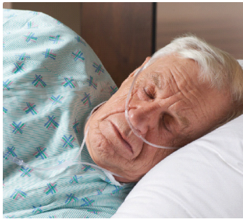
In The Hospital